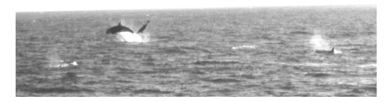
Figure 2. Killer whales attacking a bottlenose dolphin off Punta Falsa, northern Peru.